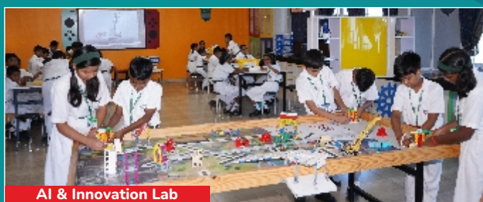
AI & Innovation Lab

Activity Rooms: The school greatly emphasises providing a platform to excel in co-curricular domains. It has facilities such as a Robotics Lab, Arts and Crafts rooms, Vocal Music rooms, Dance studios, Guitar and Instrument rooms, and Theatre spaces in each wing, where qualified teachers train the students.