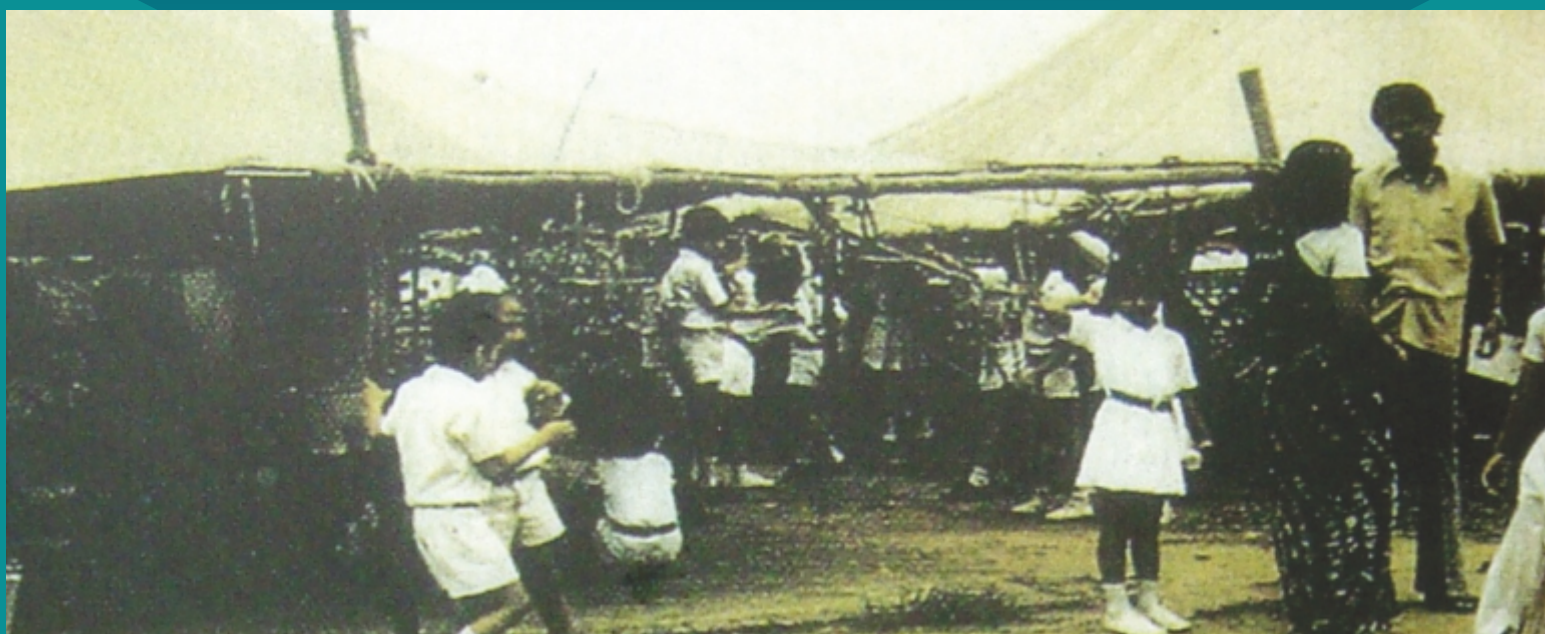
Photograph of the first Delhi Public School operational at Presidential Estate in late 1940s