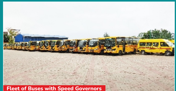
Fleet of Buses with Speed Governors