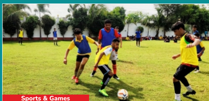
Sports & Games