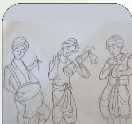
TANU PRIYA (VIII-E)