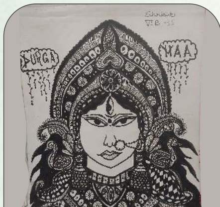
TRISHA VERMA (VI-B)