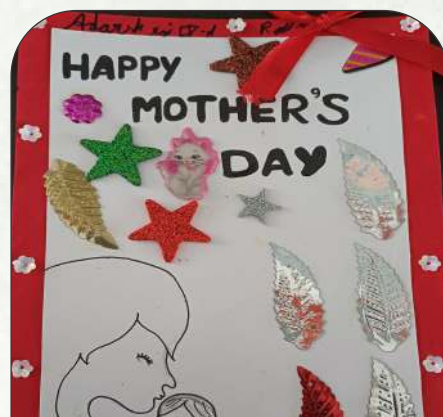
ADARSH RAJ (IV-J)