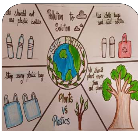
AANYA RIDDHI V-A