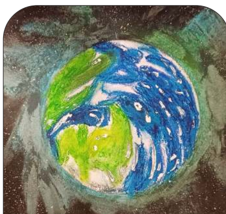
SHIVANI RANJAN V-H