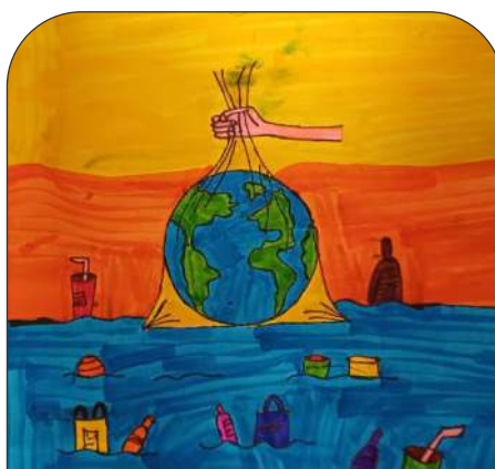
TEJASHWI RAJ IV-G