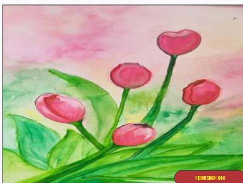
RIKSHI SINGH 12-D