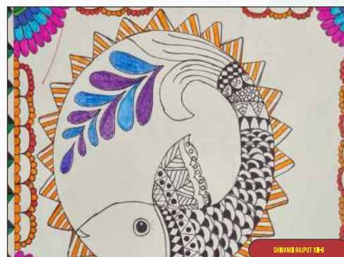
SHIVANSHU RAJPUT 12-B