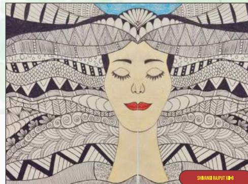
SHIVANSHU RAJPUT 12-B