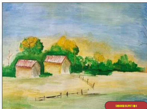
SHIVANSHU RAJPUT 12-B