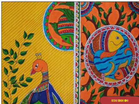
DESHI SINGH 12-B